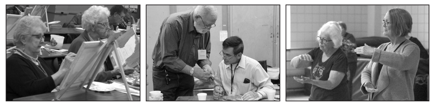
Hybrid delivery allows participants to choose to attend either in person or via Zoom.

Tuesdays, 11:30 a.m. – 1:30 p.m. (Hybrid)